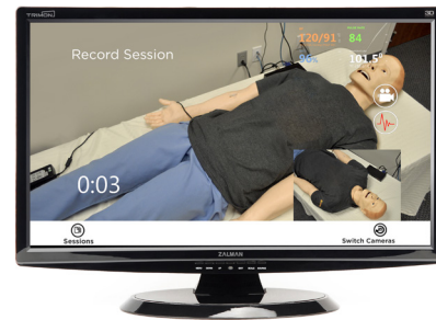
One touch-enabled all-in-one computer